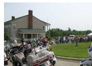
More than 120 bikers visit the Dave Ehrler Memorial Gardens and the Apple Patch Annex!